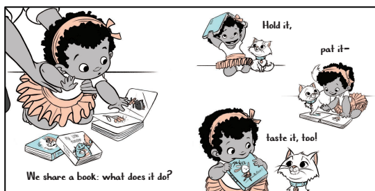
Sample page spread: Hands on

Available for agencies, clinics and non-profits from All About Books and custom printings from Blue Manatee Press!